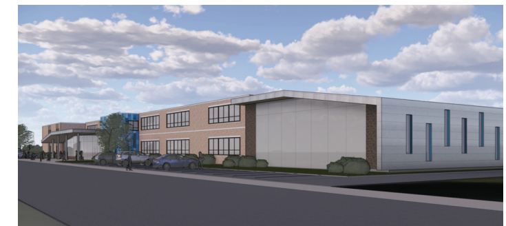
Multipurpose Space View