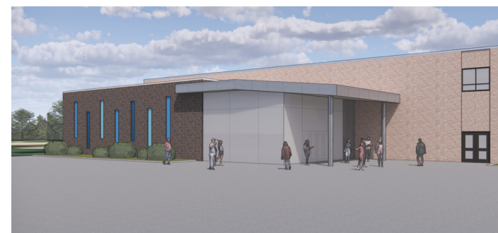
Locker Room View