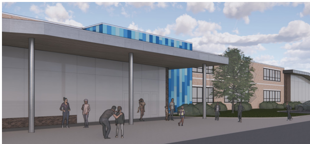
Front Porch View

As enrollment continues to grow, we will need additional learning spaces for students. The result is an 8 classroom addition to accommodate expected continued growth in grades 4-8 and the renovation of most interior spaces. It will also include refreshing the school brand, centralized administrative and office spaces, and the creation of a more welcoming space for parents and guests.