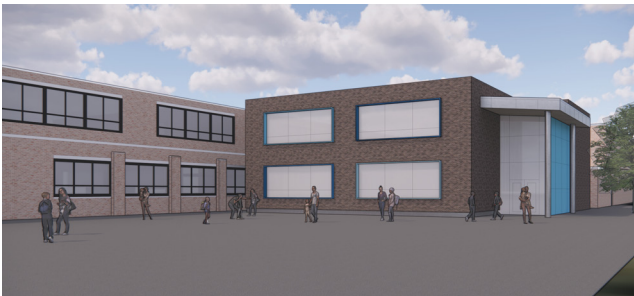
Classroom Wing View